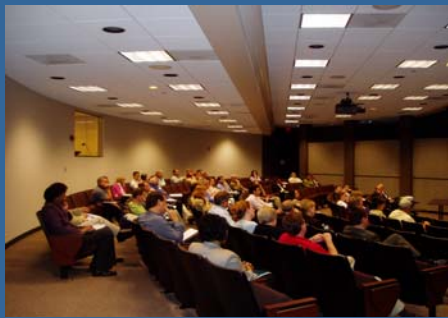
“Import Essentials” Seminar held in the Advanced Education Center in Tupelo.

The Mississippi Development Authority in partnership with the Mississippi World Trade Center, Tupelo’s Community Development Foundation, and Itawamba Community College recently conducted an international business educational event designed for North Mississippi firms. The half-day seminar, “Import Essentials: Understanding Customs Procedures, Banking & Logistics,” was held on April 6, 2006, at the Advanced Education Center in Tupelo and covered a diversity of topics that included an introduction to importing, customs compliance, dealing with documentation, the role of customs brokers, and targeted international banking information.