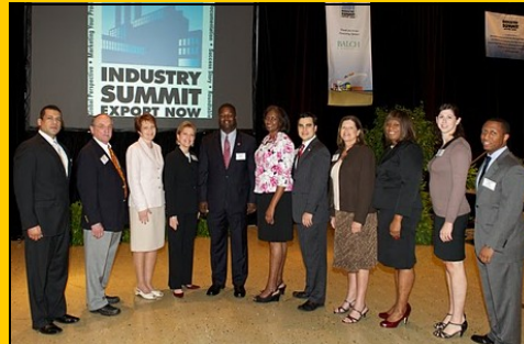
This Industry Summit was presented by the above representatives from several organizations.